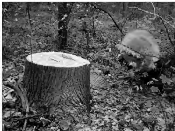
Figure 1. Healthy, mature trees were cut down in Welwyn Preserve.

Over the next few days, a broader picture emerged. The destruction from Hurricane Sandy in Nassau County’s preserves couldn’t compare to the damage being done in the name of public safety. Crews were brought in from out-of-state to cut, section up, and possibly remove all “dangerous” trees—those with hollowed trunks, broken branches, or leaning at angles greater than 15-30 degrees. At Muttontown Preserve, over protests of the part-time staff, crews came in with ATVs, Bobcats, and other heavy equipment. Stillwell Woods Preserve in Syosset